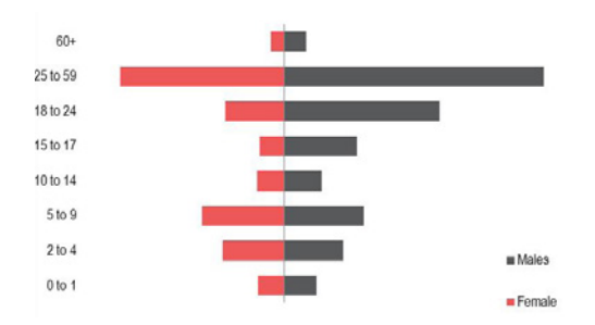
Figure 1: Age and sex distribution of interviewed groups

Of the 39 individuals interviewed who identified as an unaccompanied minor, 95% of them were males 15-17 years of age, the remaining 5% were males aged 10-14 and travelling either with adults they had met along the journey or friends of family. In addition, 14% of men interviewed reported travelling alone without family, the majority of these (65%) young men aged 18-24.