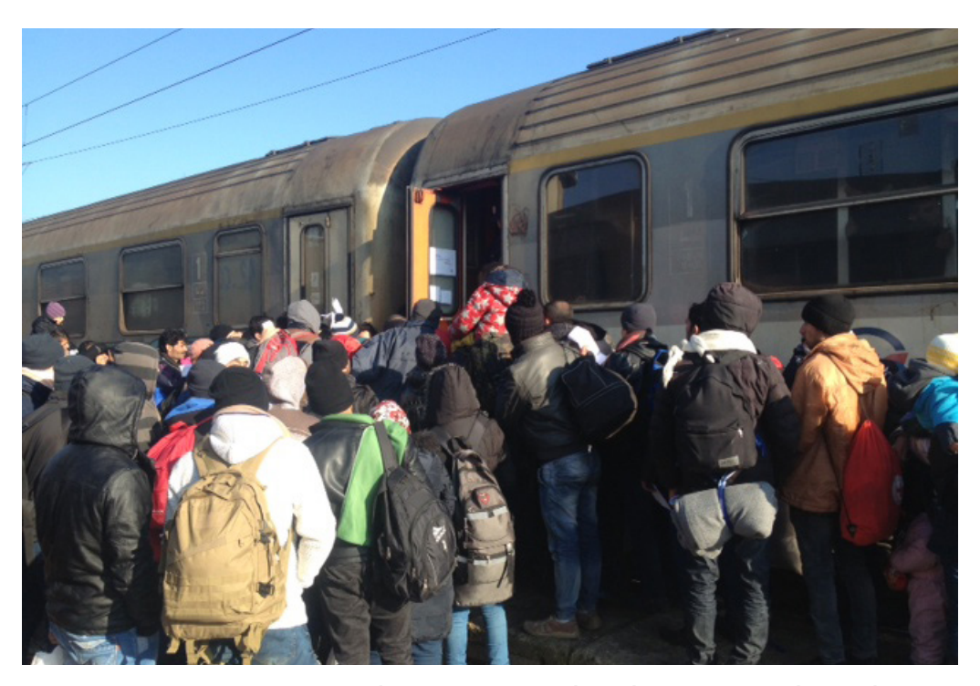
Image1: People gather to board the train from Presevo, Serbia to Sid on the border with Croatia.

In coordination with its partners, REACH will continue to monitor the situation of migration to Europe over the coming months. In the next monthly Situation Overview, REACH will also include information gathered from data collected in areas of origin.