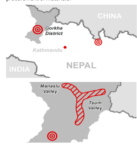
Map 1: Location map of Gorkha District and assessed valleys

monsoon and winter seasons. Residents indicated a desire to rebuild, however, they lacked materials (CGI, in particular) and technical expertise. Access constraints also appear to be a hindrance to the procurement of materials.